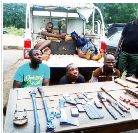
The suspects with exhibits recovered from them

AUGUST 1, 2015 : OLUFEMI ATOYEBI 26 COMMENTS