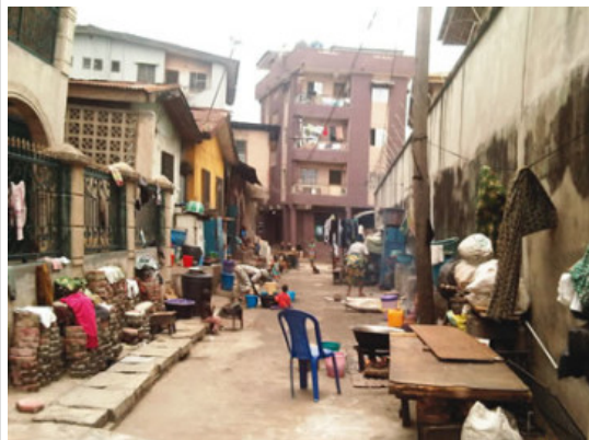
Eyin Iga Street