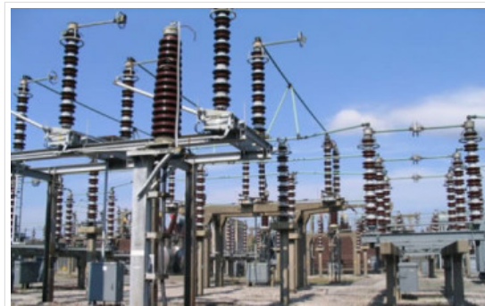
A power transmission facility.

Between January and June this year, 49 employees of electricity distribution companies in the country lost their lives while on duty as a result of the poor implementation of safety measures by the firms.