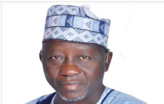
Nasarawa State Governor, Tanko Al-Makura