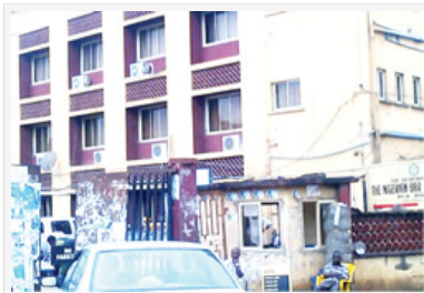
Ikeja Magistrate's Court