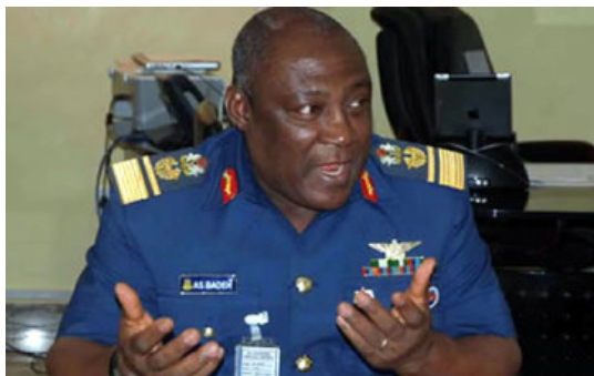
Chief of Defence Staff, Air Marshal Alex Badeh