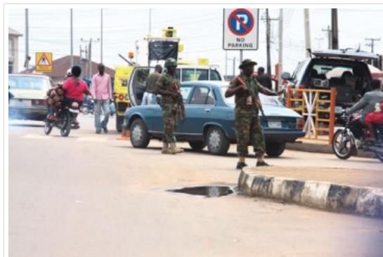
Soldiers at a checkpoint on Oba Adesida Road, Akure