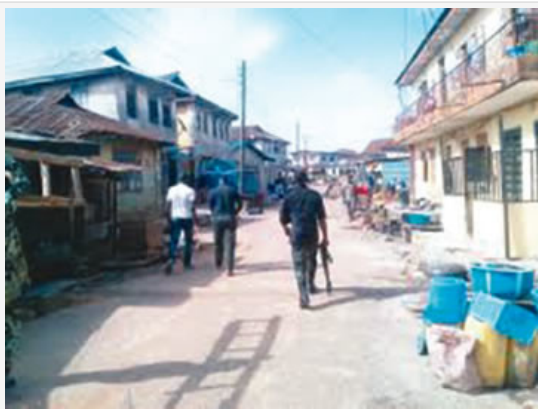
Mushin area

Two people have been killed, while at least 14 others injured after some hoodlums went on the rampage in the Idi Oro, Mushin area of Lagos State.