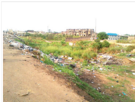
Ago Igbala, Ibafo