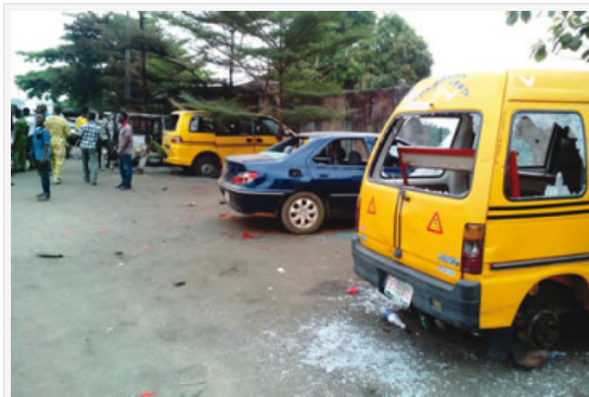
Scene of the violence clash in Oshodi on Thursday

There was confusion on Thursday at the Seven-Up bus stop, in the Ijora area of Lagos State, after suspected hoodlums clashed, shutting down business activities in the community.