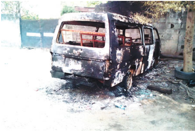
Scene of the violence

union will unravel the cause of incessant violent clashes in Oshodi.