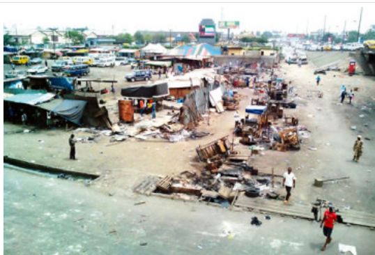
Scene of the violence