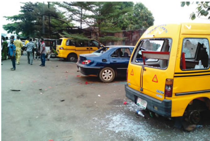
Scene of the violence

"They shot and injured three of our people, who have been rushed to hospital. We don't know why they are after us and this fight could have been bloodier, but we decided to be calm," a man in the group, who did not identify himself, said.