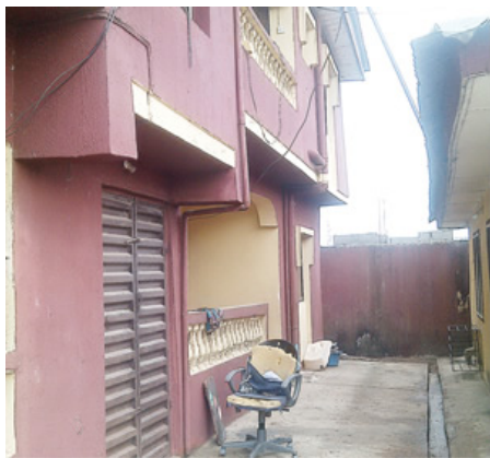
The couple's rented apartment.