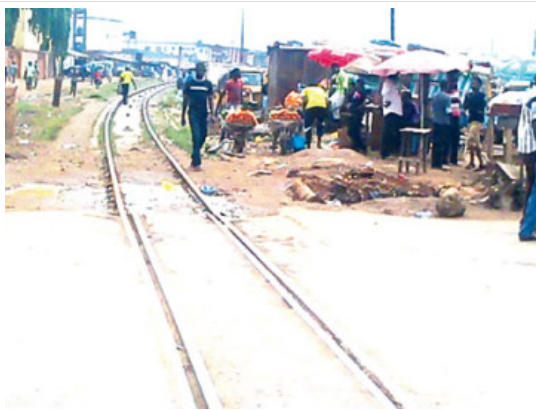
Scene of the incident