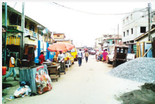
Anipele Street (arrowed, the building)