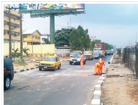
Scene of the incident

FEBRUARY 9, 2015 BY AFEEZ HANAFI 0 COMMENTS