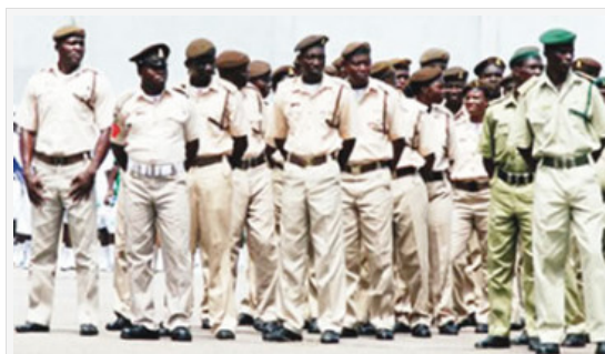
Some immigration officers at a parade