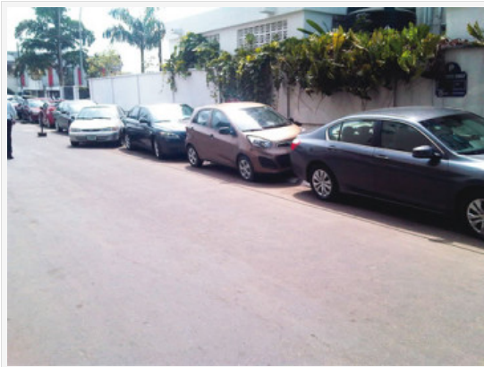
Scene of the incident