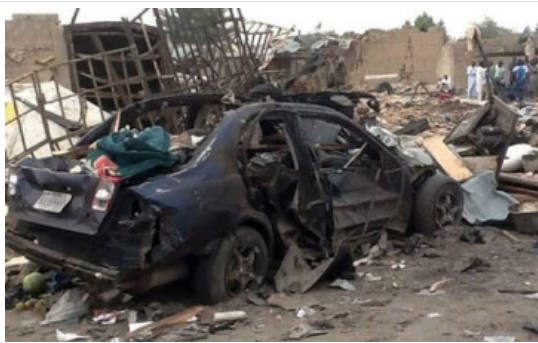
A scene of Boko Haram attack.