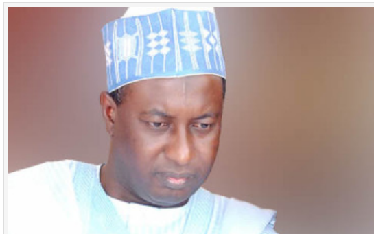
Kaduna State Governor Mukhtar Yero

AT least, 10 persons were on Saturday night killed by unknown gunmen who attacked the Tattaura village in the Sanga Local Government Area of Kaduna State.