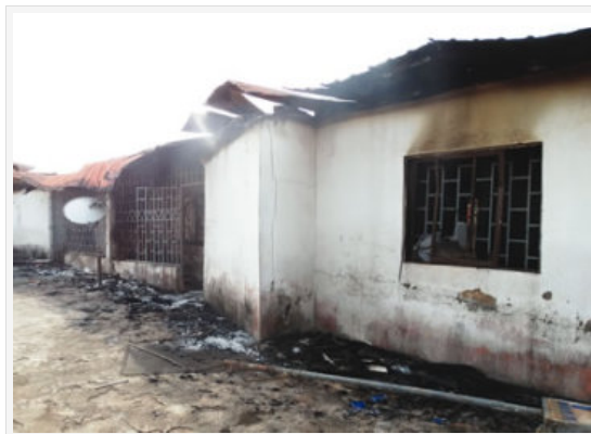
The burnt hospital

It was a sad Christmas for residents of Oke Ibukun Street, off Araromi, in Akure, the Ondo State capital.