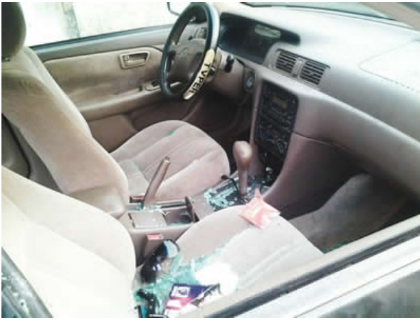
One of the vandalised vehicles

members swooped on him and started hitting him with iron and cutting him with cutlasses. They left him for dead."