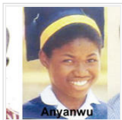
19-year-old emerges WASSCE best pupil