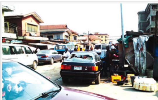
Scene of the clash

Like a war scene, continuous gun report tore through the air in the Ebute Meta area of Lagos State on Tuesday afternoon.