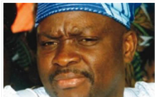
Ekiti State Governor-elect, Ayo Fayose

At least one prison official was feared killed with over 20 sniffer dogs dead on Sunday night when some gunmen stormed the Federal Prison, on Afao-Ekiti road in Ado Ekiti, Ekiti State.