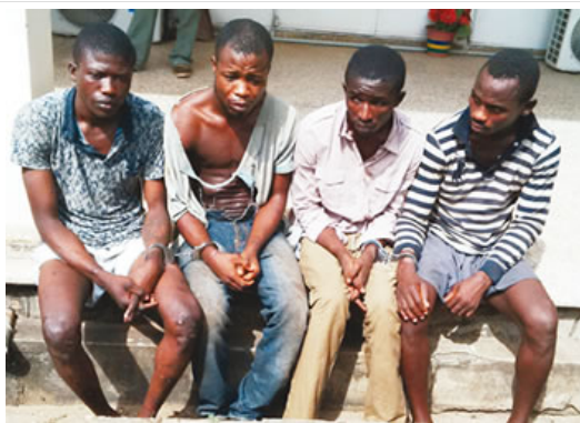
The alleged robbers.