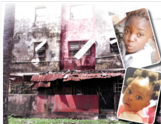
The building, Temiloluwa (up), Darasimi