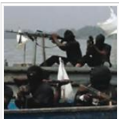
Pirates kill four policemen, abduct six in Bayelsa