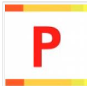
I did not ask Amaechi for Rivers' money - Patience Jonathan