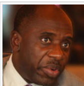
Amaechi has lost decorum, Presidency says