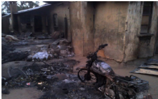
Scene of an attack.