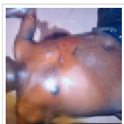
Robbers kill pastor inside church in Ogun