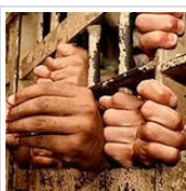
HIV carrier, 546 other Kaduna prisoners regain freedom