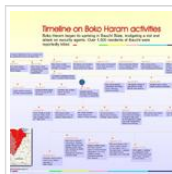
Timeline on Boko Haram activities