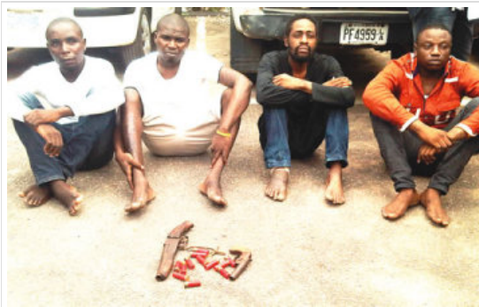
The suspects with recovered ammunition