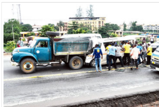
Scene of a truck accident