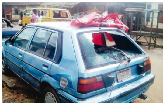
Scene of the clash

A lottery agent, Sheriff Alasia, was on Monday shot dead during a brutal cult clash at the Fadeyi end of Ikorodu Road, Lagos State.