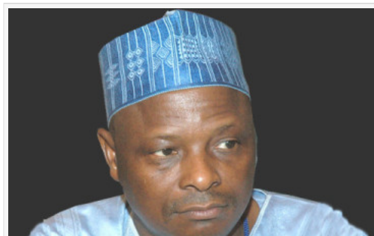
Kano State Governor, Rabiu Kwankwaso

A bomb explosion which was preceded by sporadic gunshots left over 20 people dead and 40 injured in Kano on Wednesday.