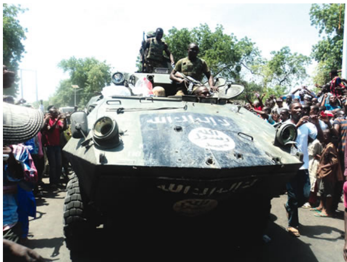
[/media-credit] Maiduguri residents hailing soldiers for repelling and killing about 300 insurgents in Konduga and Ngamdu in Borno State...on Wednesday

The military also captured one Armoured Personnel Carrier, three Hilux vans, and a cache of arms and ammunition from the insurgents.