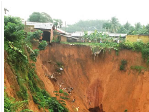
An area affected by erosion.