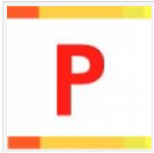
Seven killed in Kenyan bus hijack