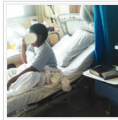
Amazing! Patients pay doctors to use surgical equipment at Igbobi hospital