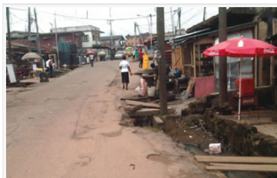
The area of the clash.