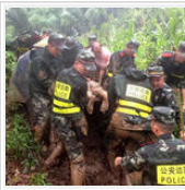
10 dead, 10 missing in China mudslide