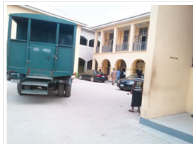
Ebute Meta Magistrate Court