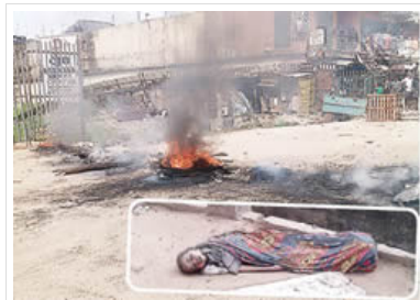
The scene of the protest. Inset: The corpse