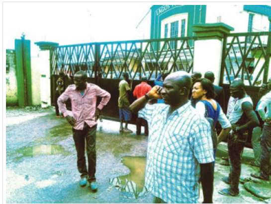
Stranded passengers at Iddo station

A Nigerian Railway Corporation commercial train crashed into the Iddo Station Complex, Oyingbo, Lagos on Sunday night, killing the driver on the spot.