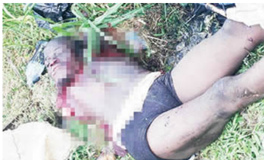
The victim's remains.