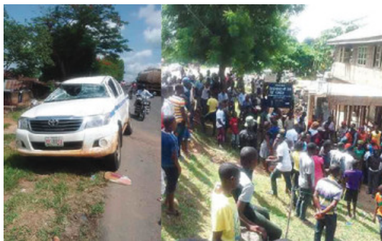
One of the vehicles and angry youths.