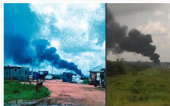
The scene... on Sunday