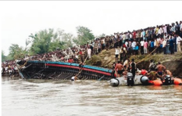
Scene of a boat accident.