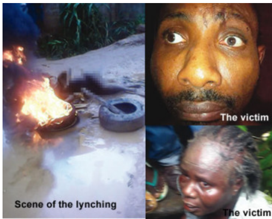
The victim and the scene of the lynching

Like a scene from a horror movie, residents of Abule Egba, a suburb of Lagos State, grabbed an elderly woman suspected of kidnapping two children and descended on her on Tuesday.