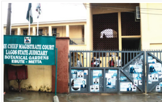
Ebute Meta Chief Magistrate Court