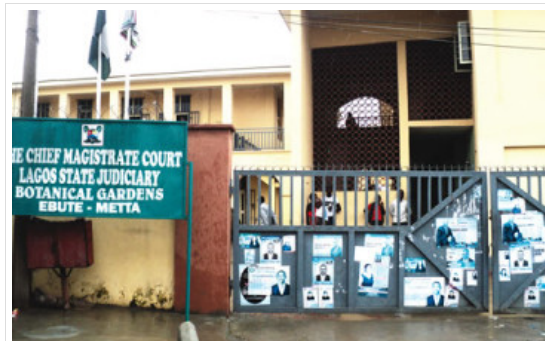
Ebute Meta Chief Magistrate Court