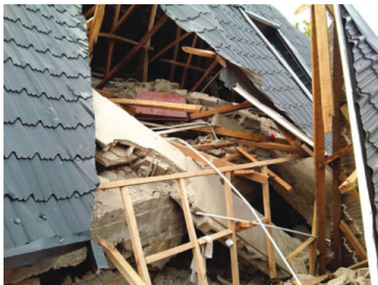
The collapsed structure

Residents around a collapsed building in the Oworonshoki area of Lagos fear that a construction worker may be lying dead in the rubble, OLALEYE ALUKO reports