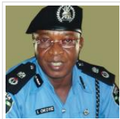
Ogun police arrest Arab for robbery