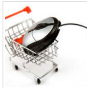
Explore online shopping platform, Konga urges Nigerians