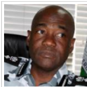
Police to pay N25m for suspect's death in custody