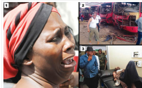
(1) Mother of a victim (2) Some of the burnt buses (3) President Goodluck Jonathan at the Asokoro General Hospital, Abuja...on Monday.