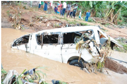
A bus affected by the flood.