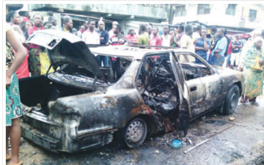
The burnt vehicle.