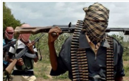
Boko Haram members

Bandits suspected to be Boko Haram terrorists on Wednesday bombed a police station, a bank and a Sharia Court, killing seven policemen and a civilian guard in Gwaram Sabuwa, Gwaram Local Government Area of Jigawa State.